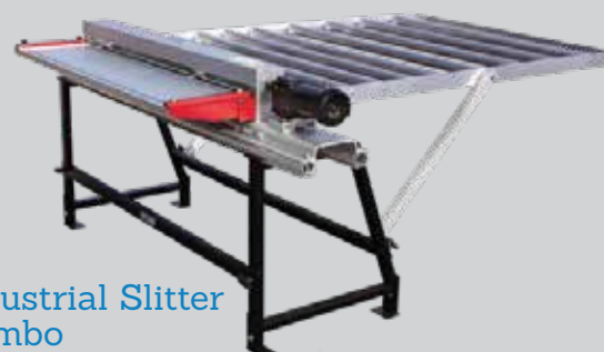
Industrial Slitter Combo