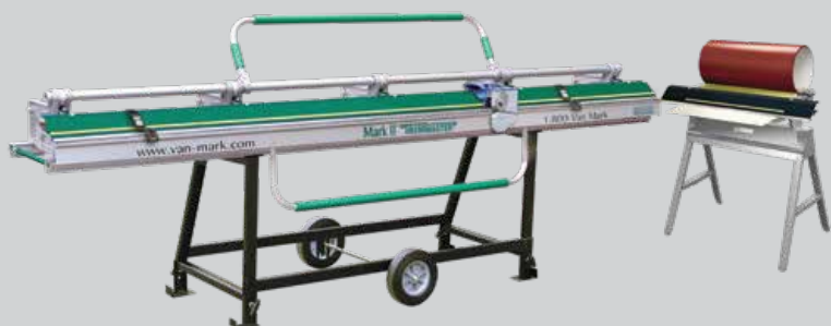
TrimMaster Mark II (shown with optional TrimCutter & Coil Dispenser)