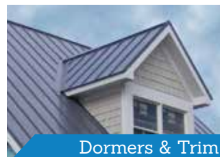
Dormers & Trim

The MM460 is simply a compact, easy to transport version of our popular MetalMaster 20 brake. Utilizing the unique to Van Mark cam-lock system as well as our AccuTrack accessory rail system that allows for expanded capabilities by pairing it with our line of brake mounted accessories.