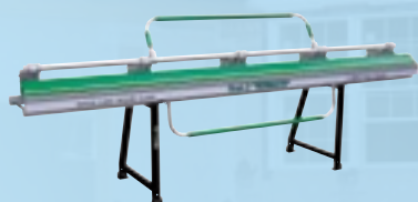
Mark II TrimMaster® TM10