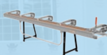
Trim-A-Brake™ II T1050