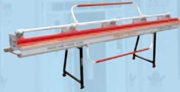
Mark I Series™ M10